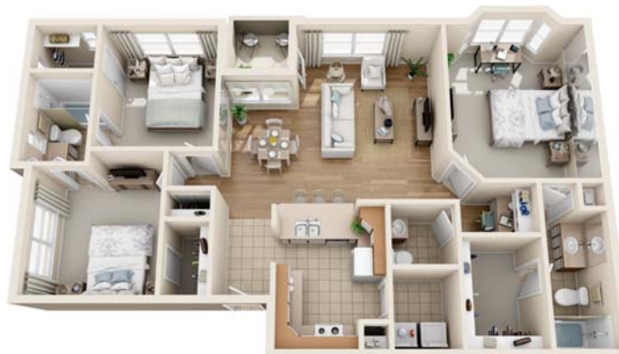
C1 1188 Sq. Ft. 3 Bedroom / 2 Bath