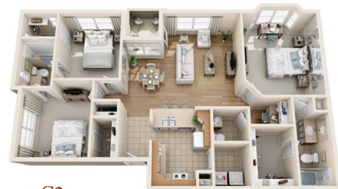
C2 1333 Sq. Ft. 3 Bedroom / 2 Bath