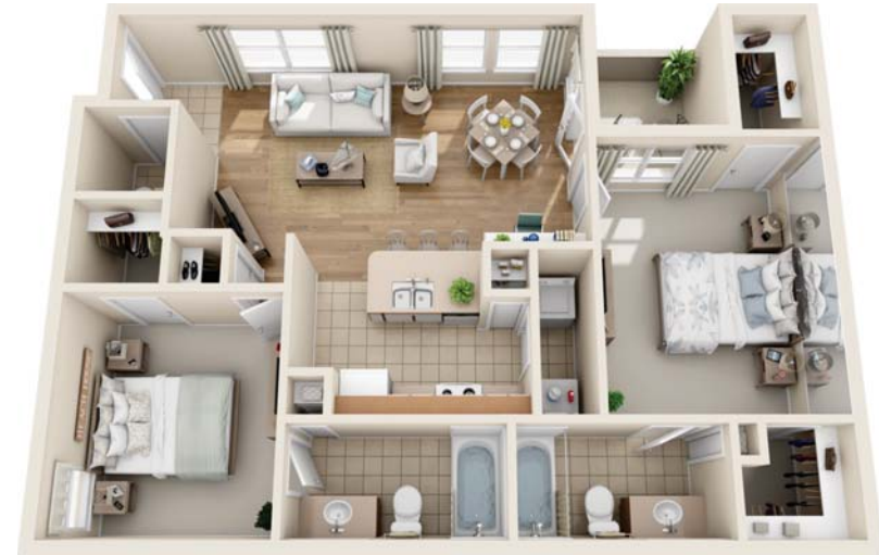
B1 1015 Sq. Ft. 2 Bedroom / 2 Bath