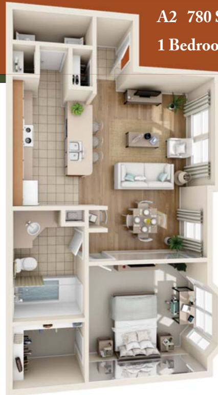
A2 780 Sq. Ft. 1 Bedroom / 1 Bath