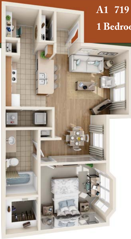
A1 719 Sq. Ft. 1 Bedroom / 1 Bath