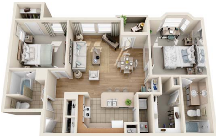
B2 1084 Sq. Ft. 2 Bedroom / 2 Bath